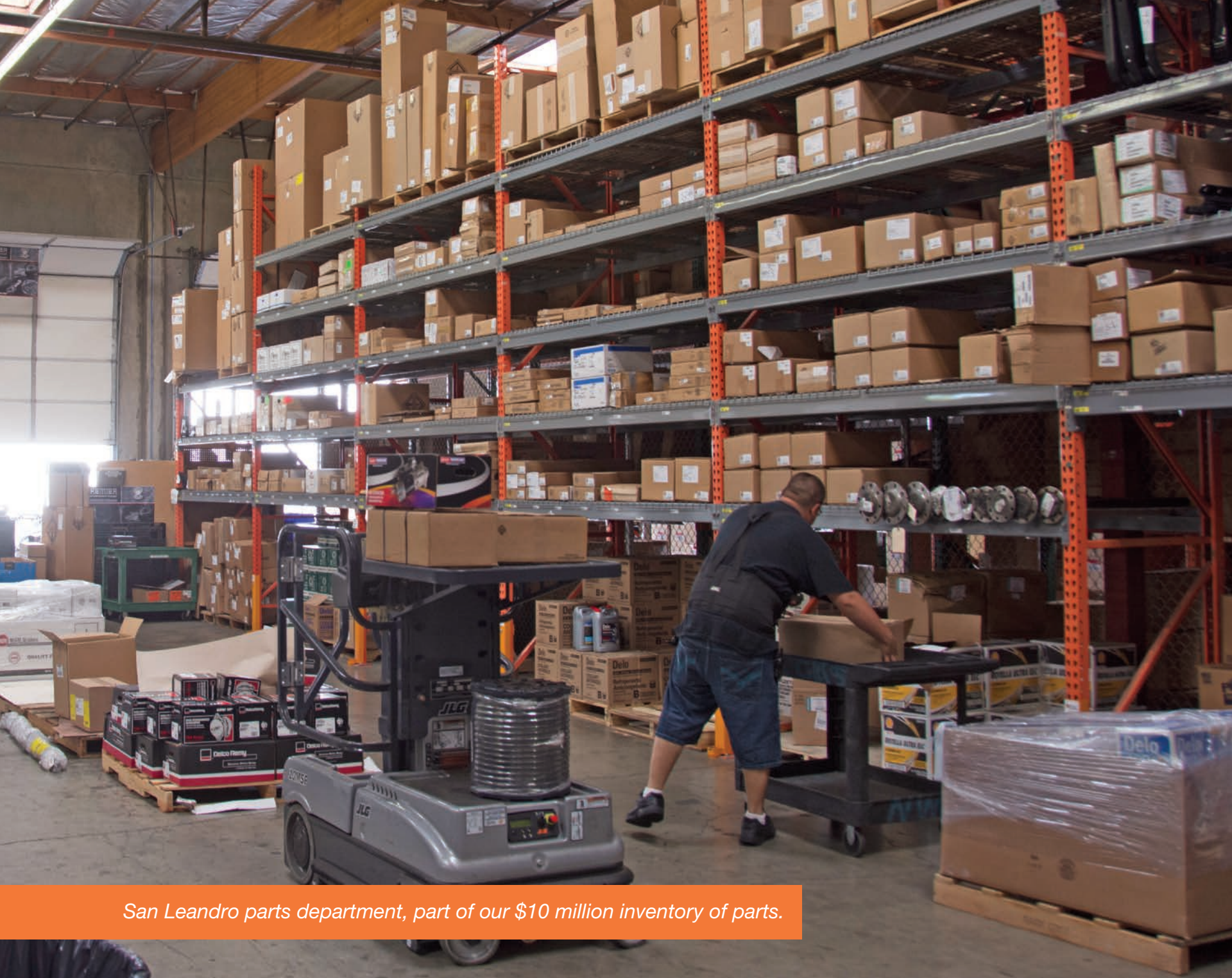
San Leandro parts department, part of our $10 million inventory of parts.