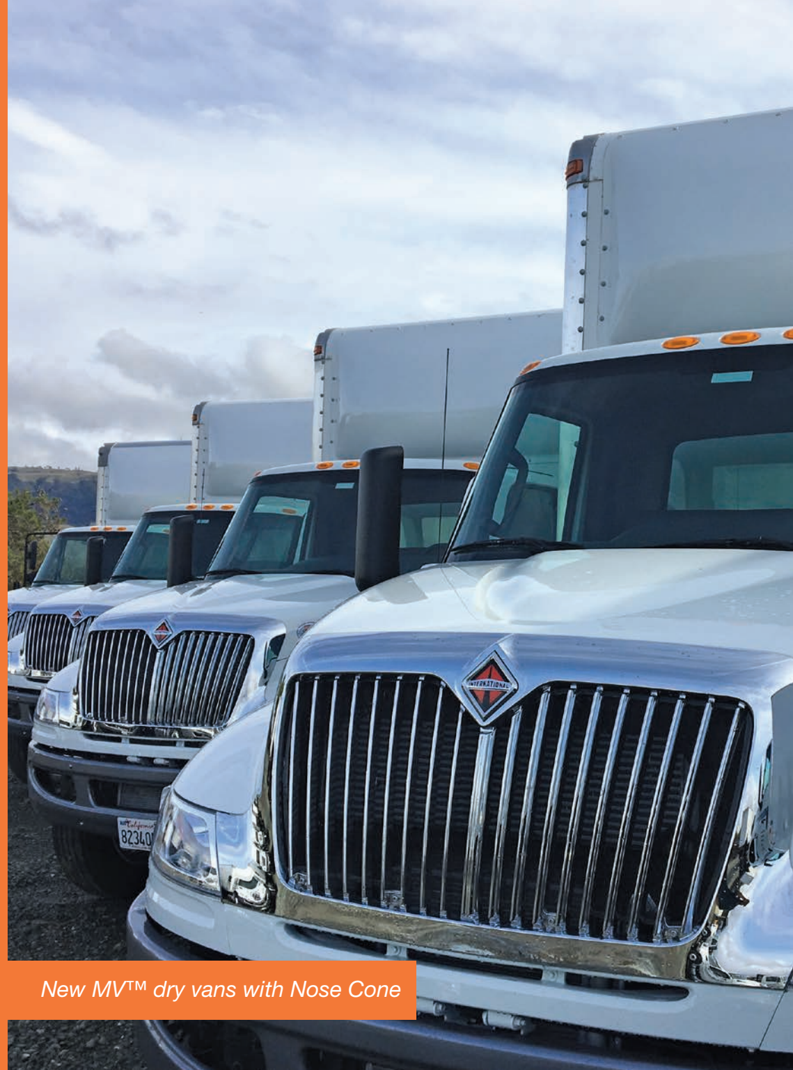
New MV™ dry vans with Nose Cone

Check out how we can save you money with Nose Cone® and driver training!