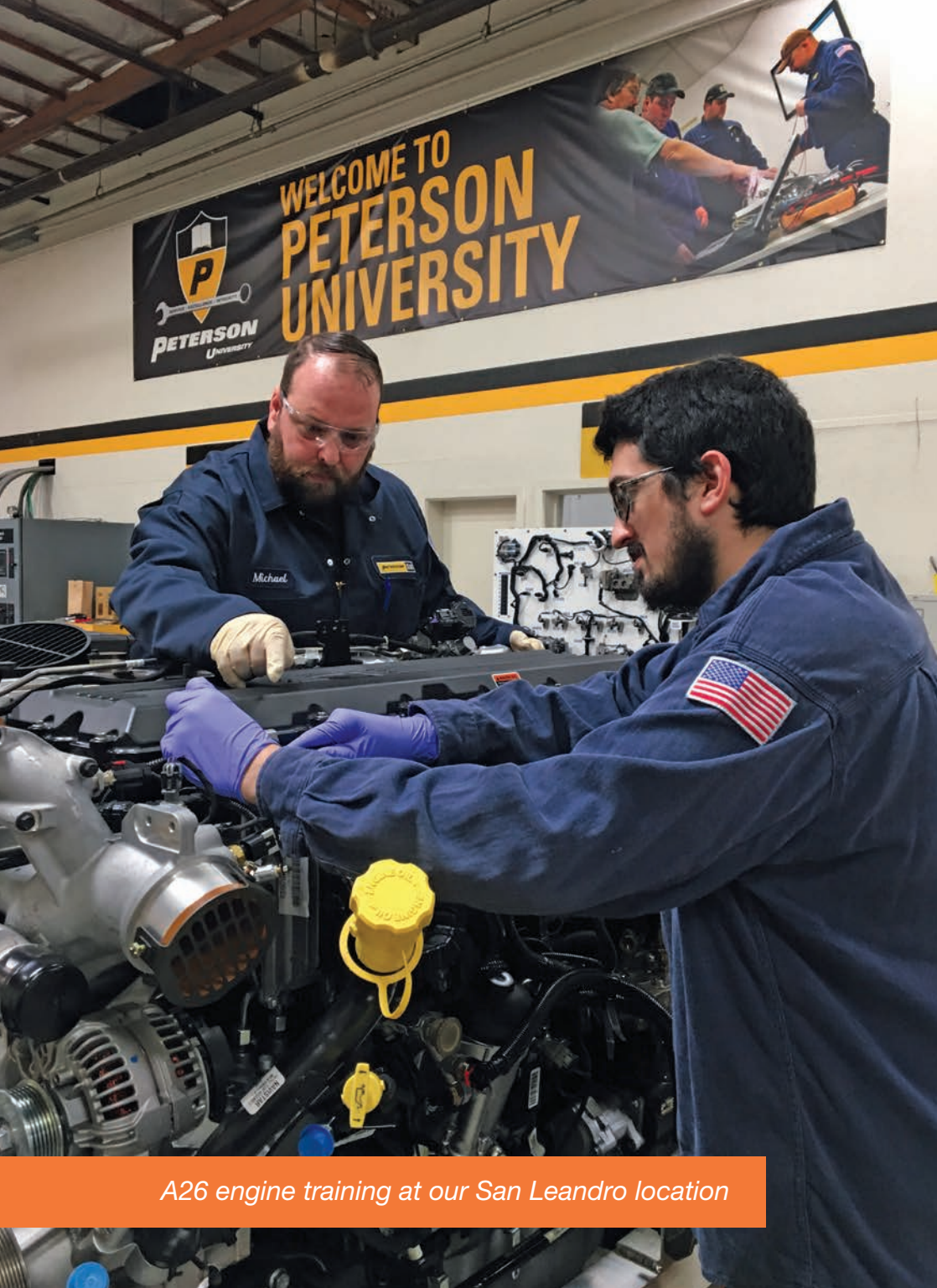
A26 engine training at our San Leandro location