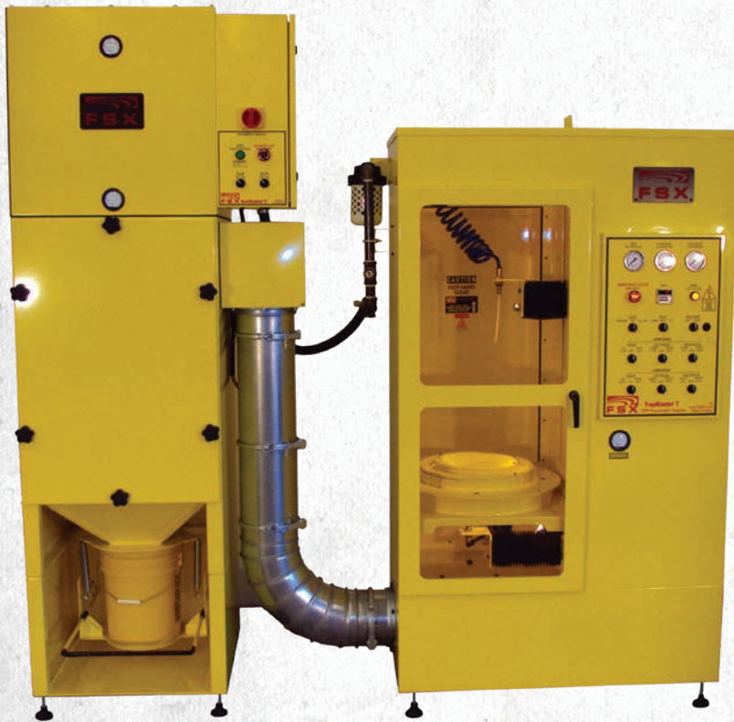
Dust & Ash Collector